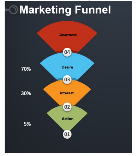
Figure 1: MARKETING FUNNEL

With the same principle, Dominos launched its DMX program. It not only increases its margins but also increases consumers interest and attention on the type of deliveries they are doing. Eventually this interest leads to enormous increase in sales revenue. It is only the DMX program that helped Domino's to become world's biggest fast food company and it also beat its immediate rival pizza hut after 30 years.