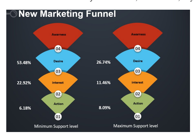
Figure 2: New marketing funnel

Website: ijetms.in Issue:4, Volume No.4, July-2020 DOI: 10.46647/jjetms.2020.v04i04.001