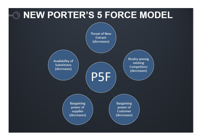
Figure 6:New Porter's 5 force model