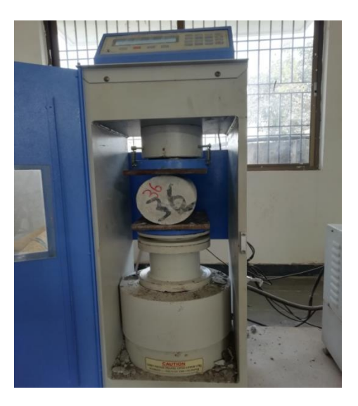
Fig.4 Testing of cylindrical specimen