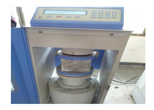
Fig.3 Testing of cube specimen