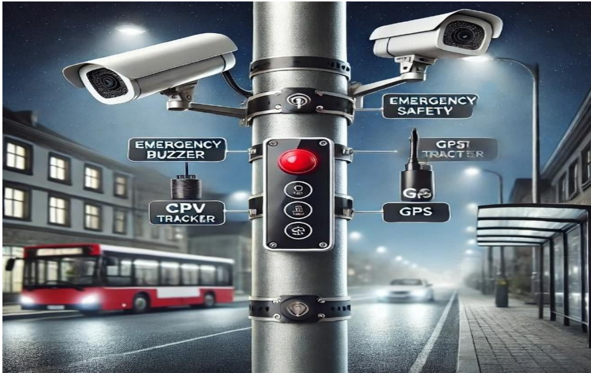
Fig [1].Built-in Buzzer system

victims and deter crimes. Society needs to come together and form safe places where women can live without the fear of violence or discrimination[6].