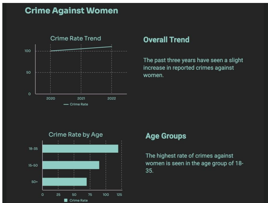
Fig [2]. Crime Rate Review

stand-alone devices that have worked exceedingly well in times of crisis. Such integration into smart street lamps makes such provisions even better for urban security. They usually come integrated with motion detection sensors that act upon detecting movements in real time, making them a sure case[11].