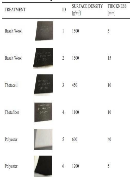
Table 2. Properties of the materials

Hence, improvement of a cabin body structure under the constraint of noise, vibration and harshness (NVH) behaviour is a challenging task and reduction of noise inside the cabin structure by using